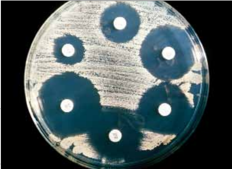
Figure 4: Culture-based methods remain the cornerstone of diagnosis and resistance testing

detection of many different targets, and high cost. Ideally, so-called sample-in to results-out technologies are needed that integrate sample preparation, amplification, detection, and analysis. The system should be able to detect pathogens and host biomarkers (proteins and nucleic acids) simultaneously. Sample preparation remains the largest bottleneck in miniaturised diagnostics: 134 large volumes (several millilitres of blood) need to be reduced to small amounts (in the order of microlitres); the microbial load in the sample can vary a lot and be very low; the target should remain intact, but many complex specimens contain nucleases or inhibitors of nucleic acid amplifications. Therefore, most sample preparations of available miniaturised molecular systems rely on many operations, and need several liquid additions and washing steps.